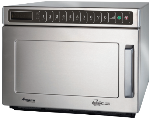
Model HDC18SD2 shown