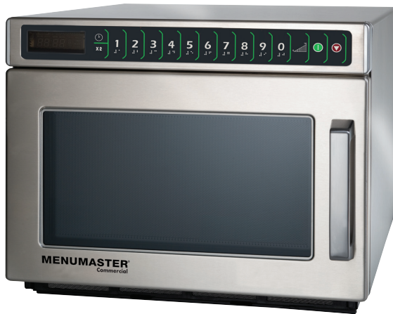
Model CHDC5142 shown