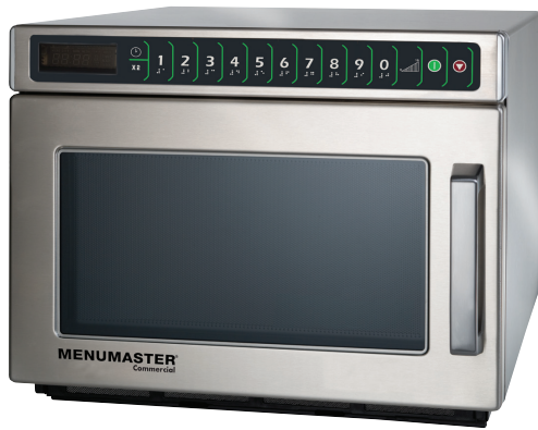
Model DEC11E2 shown