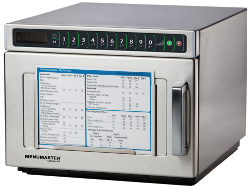
Model HDC21DQ shown