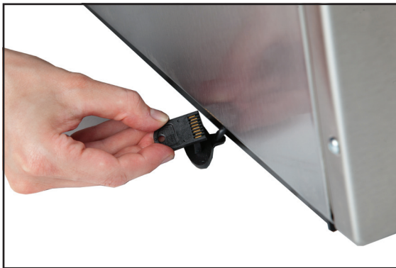
EZ Card and port shown