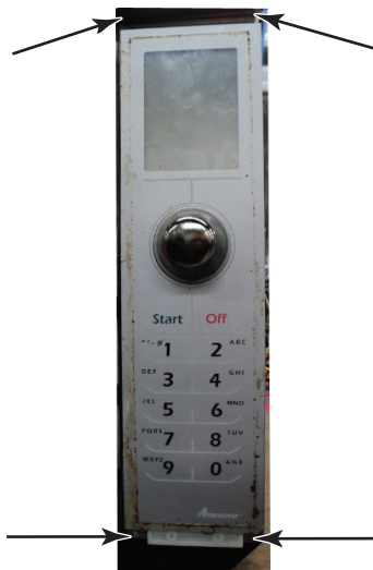
Remove 4 Mounting Screws